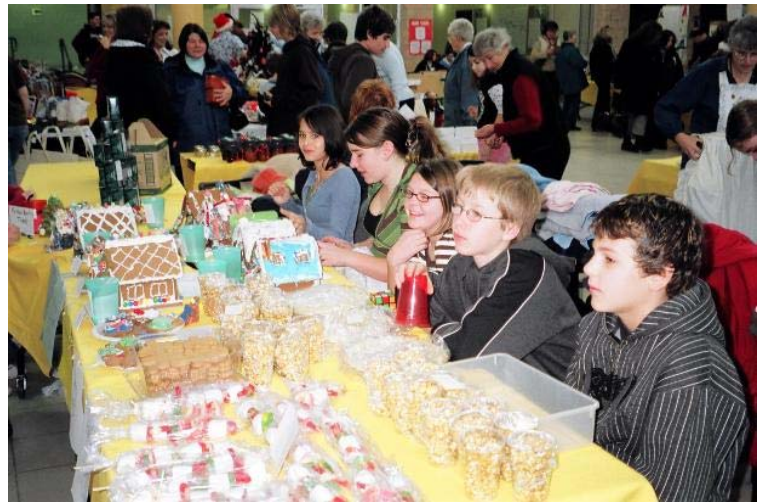
Youth Group at the Christmas Glitter Bazaar