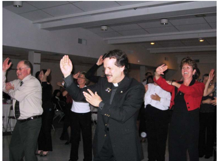
Mississauga Gala at St. Christopher's Church Hall

Please see the Parish website for more photos, prayers, links, Vatican news and a whole lot more!